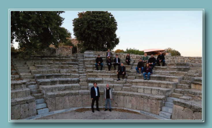
The Conference participants at Troy excavation

One of the main components of the project was the International Conference held in Edremit (Turkey) on October 26, 2021, "Aeneas in the Troad and Lazio: mythology and archeology": the proceedings are published in this volume. The summary of the conference results will be also available in an informative form through the ARISTE platform for dissemination to a larger audience and to schools.